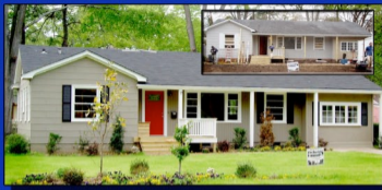
Newly remodeled Zechariah 8 home